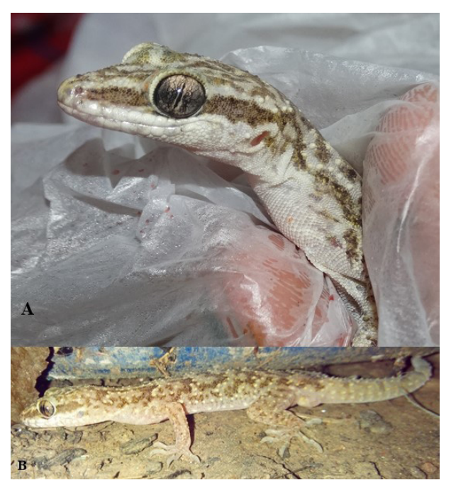
Fig. 2. Cyrtopodion himalayanus (A) Enlarged lateral view of head. (B) Full lateral view of the body.

rous lizard from Kashmir. Kashmir University. 234 p. Fenton LL. 1910. The snakes of Kashmir. Journal of the Bombay Natural History Society 29: 1,002–1,004.